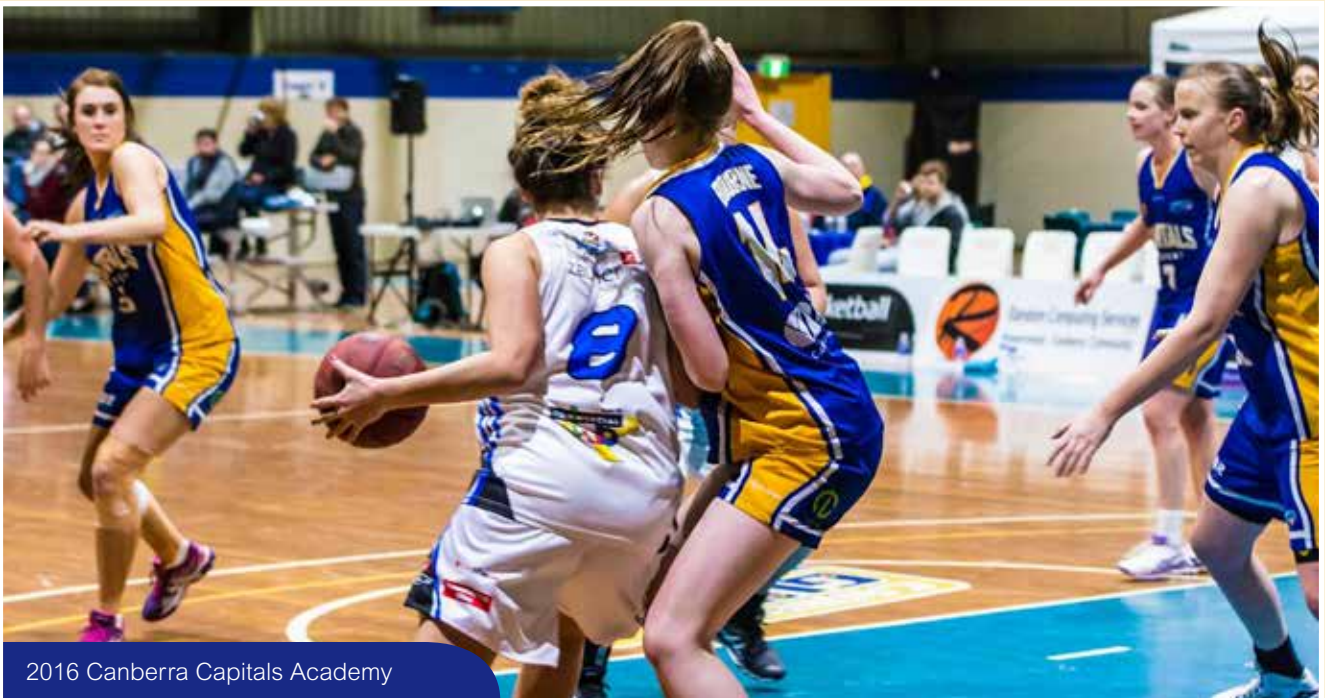
2016 Canberra Capitals Academy