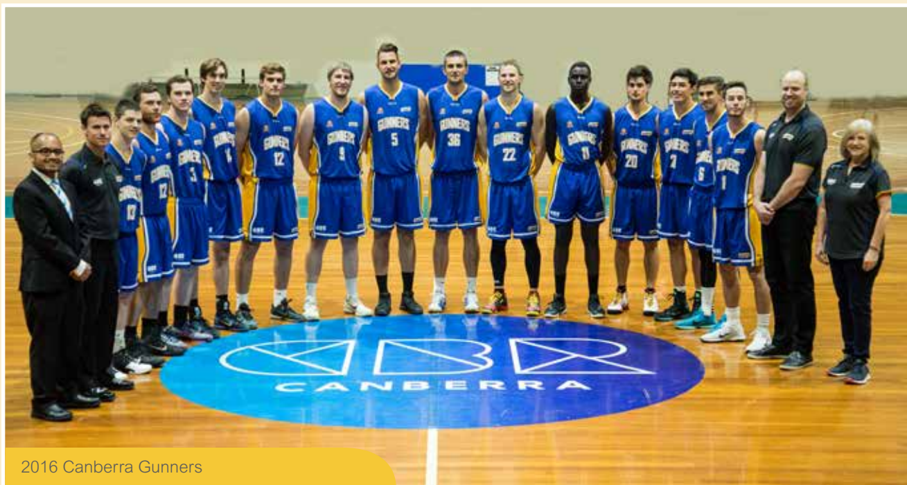
2016 Canberra Gunners