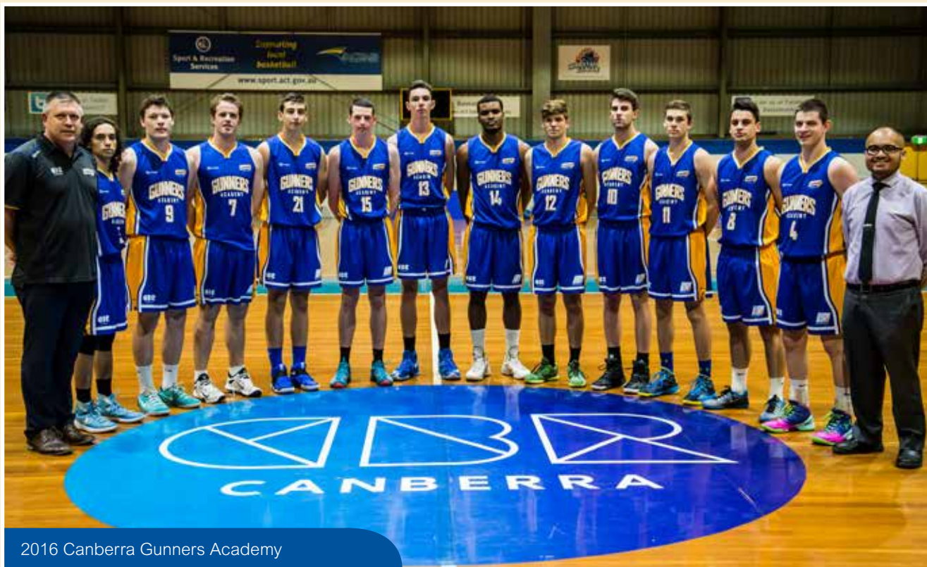
2016 Canberra Gunners Academy