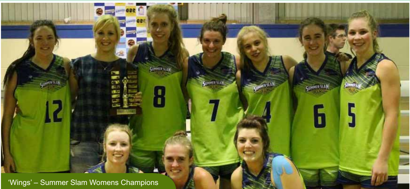
'Wings' – Summer Slam Womens Champions