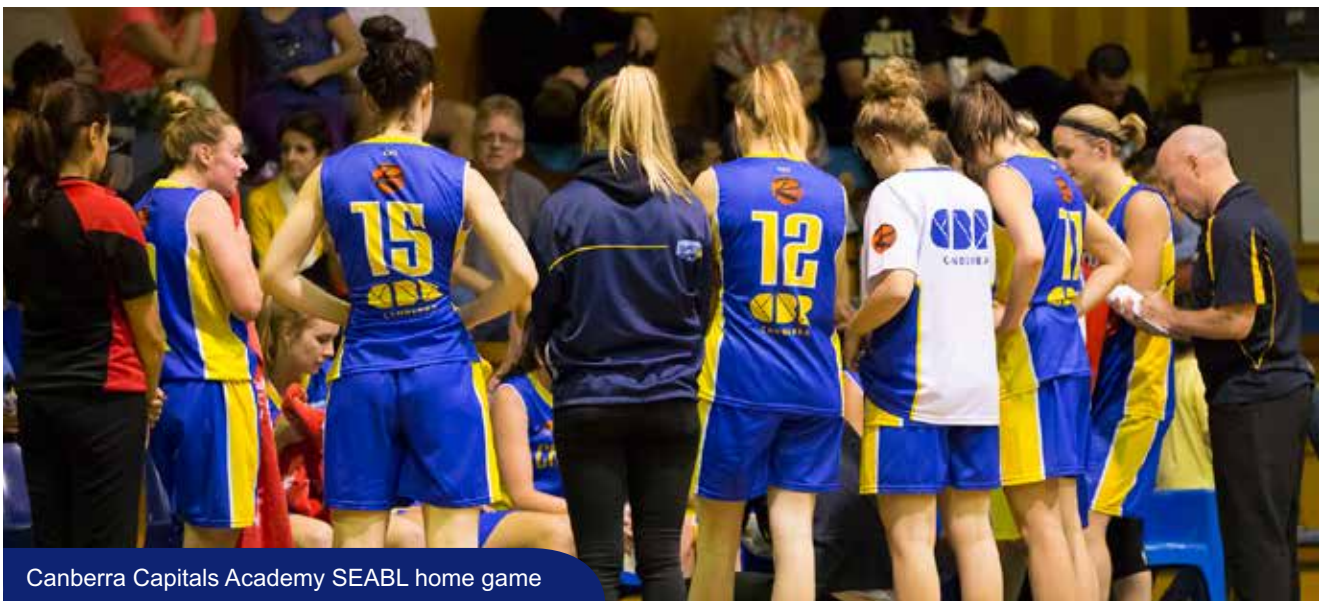
Canberra Capitals Academy SEABL home game