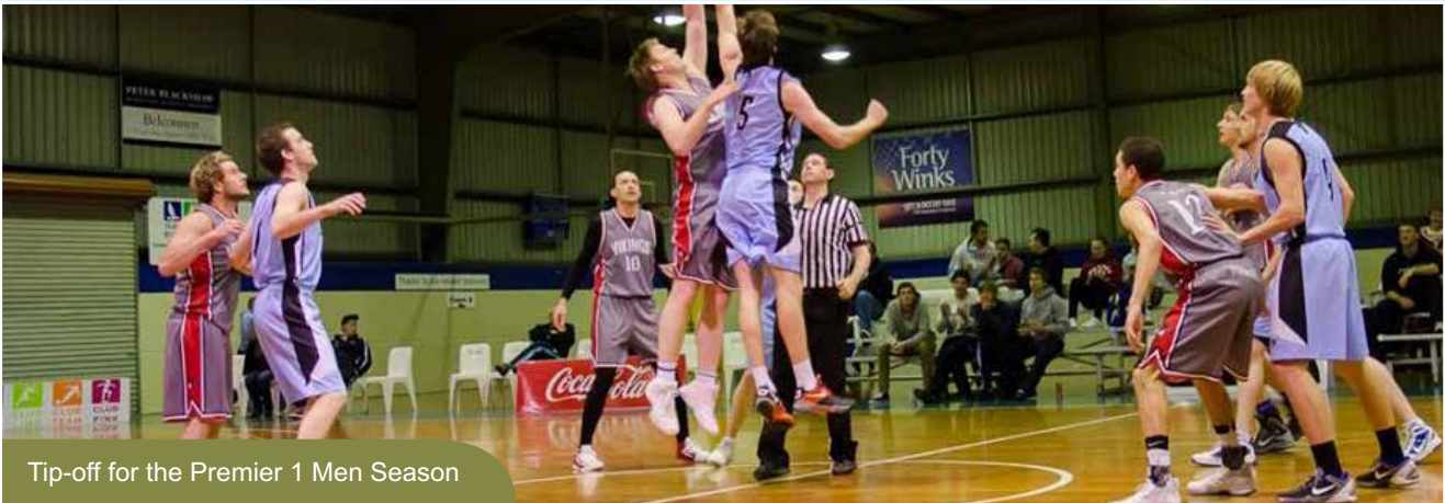
Tip-off for the Premier 1 Men Season