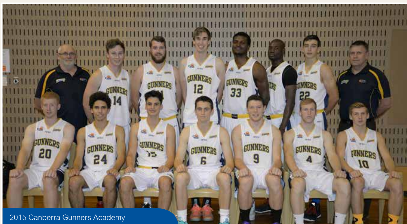
2015 Canberra Gunners Academy