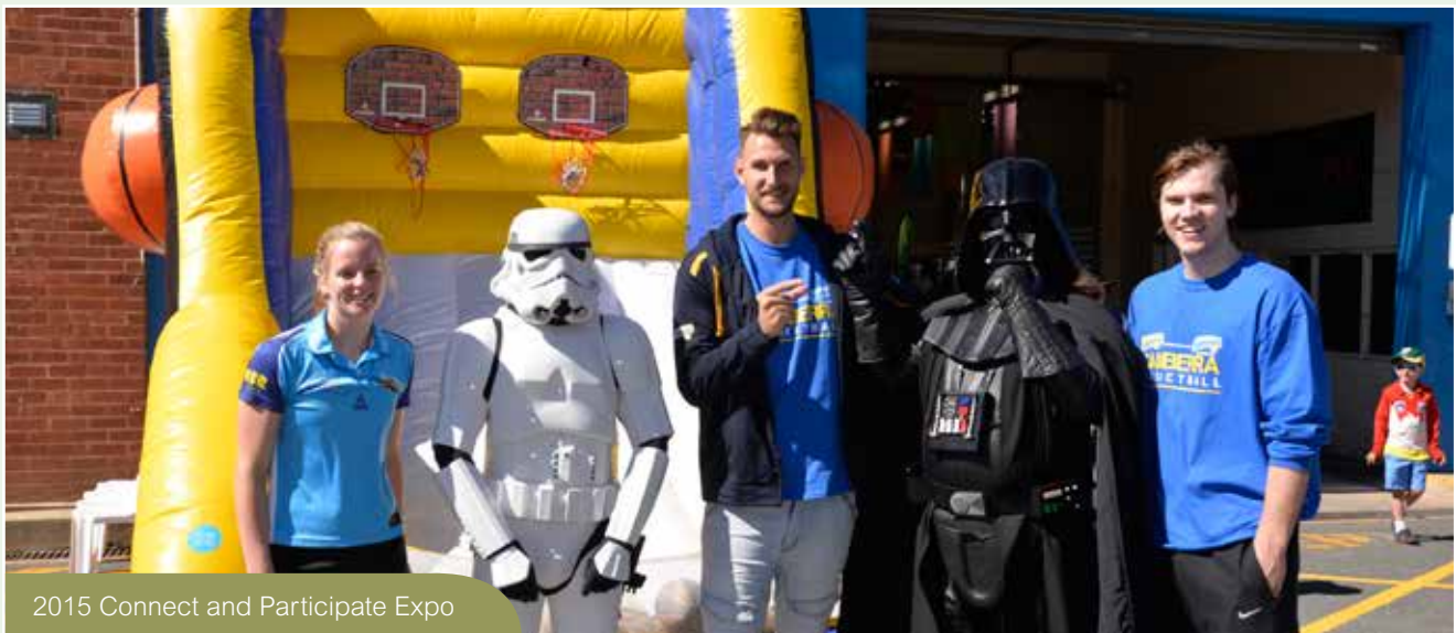
2015 Connect and Participate Expo