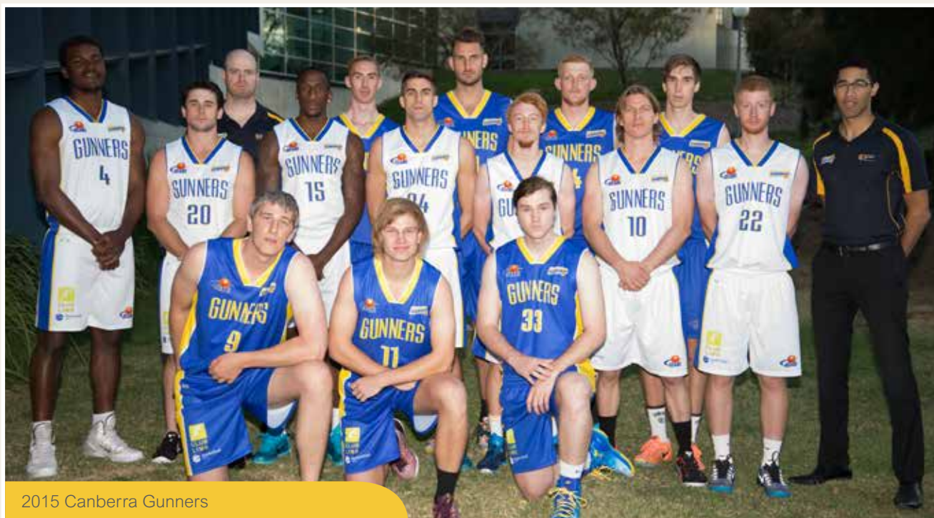
2015 Canberra Gunners